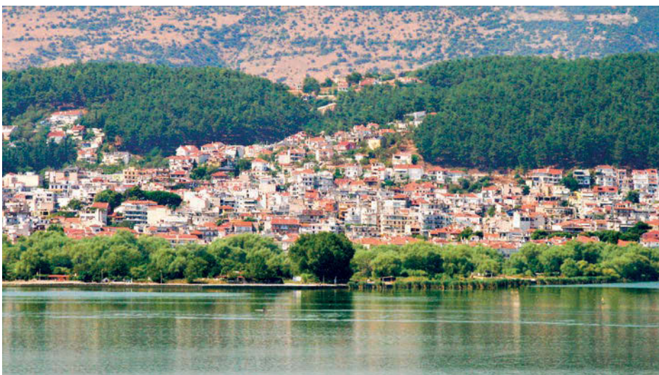
The historic lakeside town of Ioannina

It is also easy to combine Epirus with a week or two by the sea in Lefkas, Meganissi, Parga or Sivota – please call for a costing.