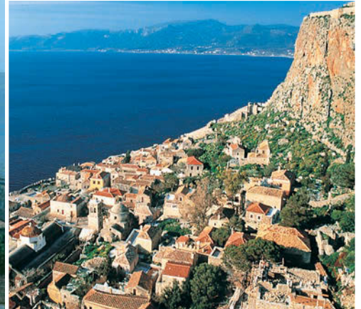
Monemvasia