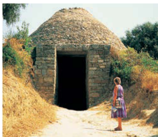
Nestor's Tomb, near Pylos

Prices are based on two persons sharing a twin room and include flights, BB hotels (usually 3 star) and car hire.