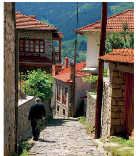
The mountain village of Metsovo