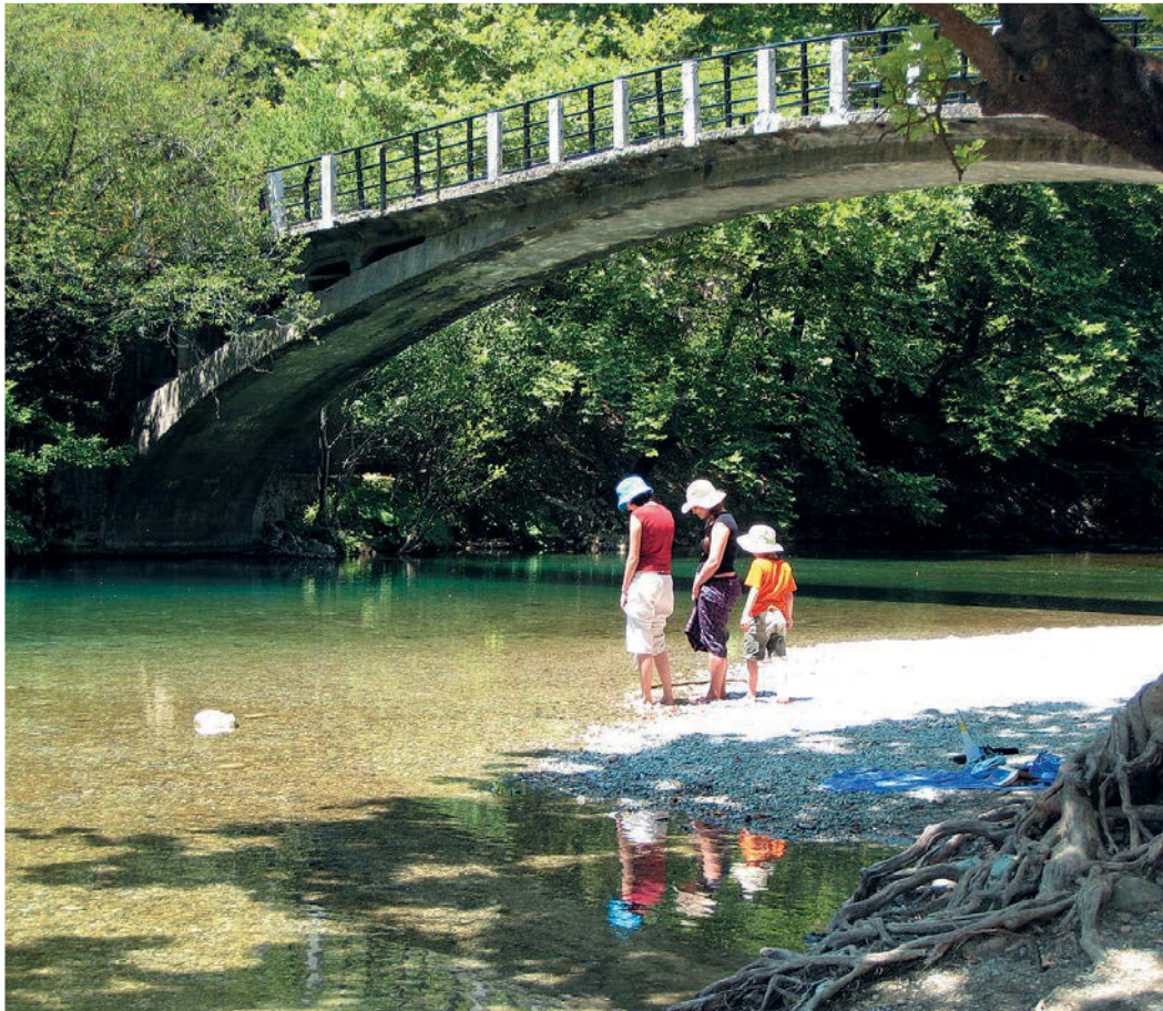
Zagori National Park